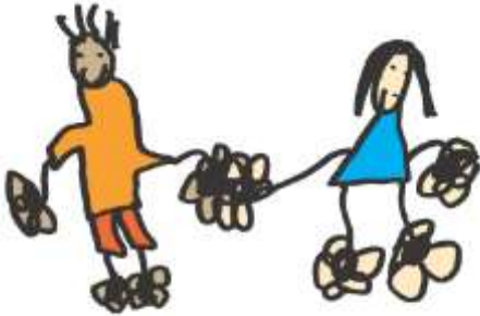
Routines and transitions